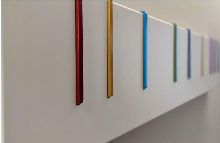
Some LGBTI friendly coat hooks

And to add in a little LGBTI magic, a set of beautiful rainbow colored coat hooks adorn each room.